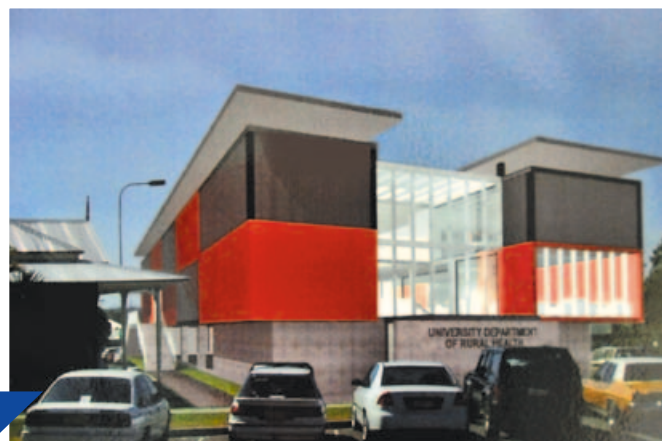
Proposed design for the education campus.

This building will help expand opportunities for trainee doctors, nurses and allied health workers and will be an important nerve centre for improving the delivery of health in the Manning region. More details are available at www.roboakeshott.com or by phoning my office on 6552 5222 or 6584 2911.